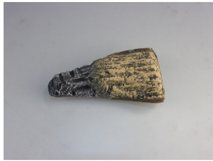
ITEM 7 - Log F