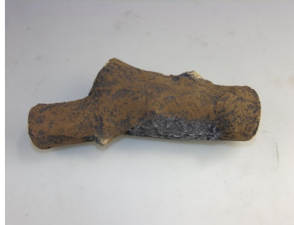
ITEM 3 - Log B