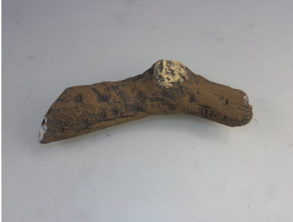
ITEM 2 - Log A