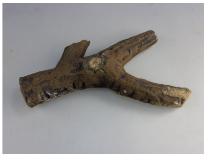
ITEM 8 - Log G