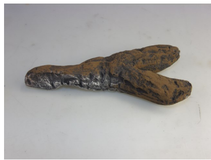
ITEM 5 - Log D