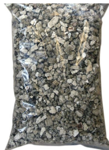
ITEM 1 - Mica Fill