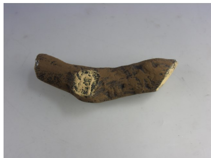
ITEM 9 - Log H