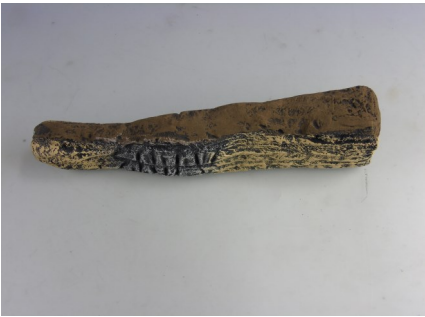
ITEM 4 - Log C