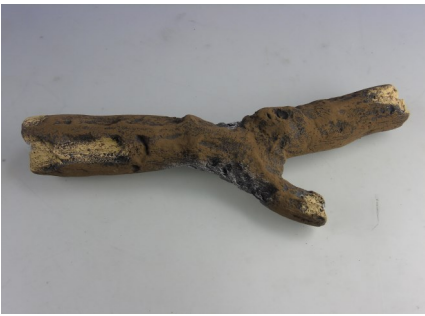
ITEM 6 - Log E